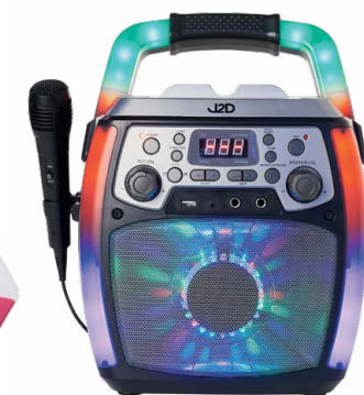
SMOKEMART & GIFTBOX karaoke machine, $159, giftbox.com.au