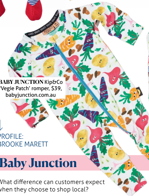
BABY JUNCTION Kip&Co 'Veggie Patch' romper, $39, babyjunction.com.au