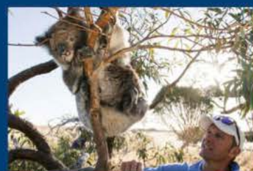
Words: Alexis Buxton-Collins