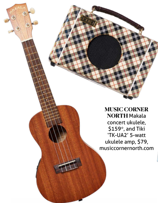
MUSIC CORNER NORTH Makala concert ukulele, $159*, and Tiki 'TK-UA2' 5-watt ukulele amp, $79, musiccornernorth.com