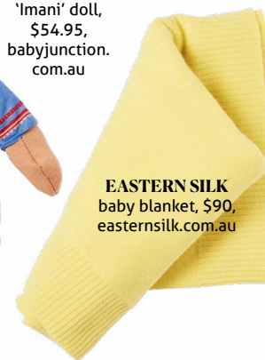
EASTERN SILK baby blanket, $90, easternsilk.com.au