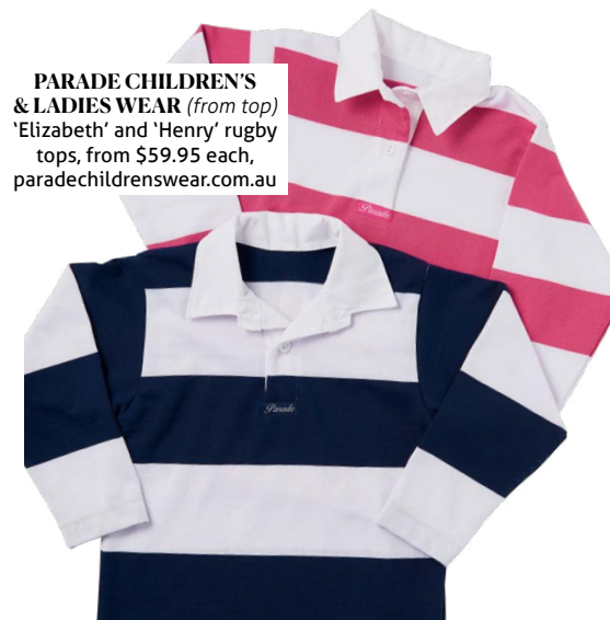
PARADE CHILDREN'S & LADIES WEAR (from top) 'Elizabeth' and 'Henry' rugby tops, from $59.95 each, paradechildrenswear.com.au