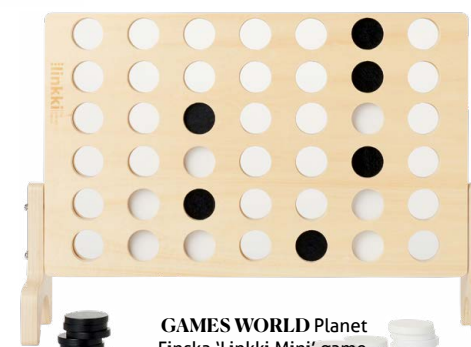
GAMES WORLD Planet Finska 'Linkki Mini' game, $69.99, gamesworld.com.au