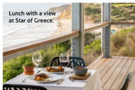
Lunch with a view at Star of Greece.

STAY After all that fun in the sun, you'll be needing to rest up and recharge, ready for the next day's adventures. Set back from the foreshore, Aldinga Beach Holiday Park