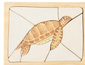
THE INFANT BOUTIQUE Land of Rhi puzzle, $40, theinfantboutique.com.au