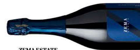
ZEMA ESTATE 2018 Sparkling Merlot, $38, zema.com.au