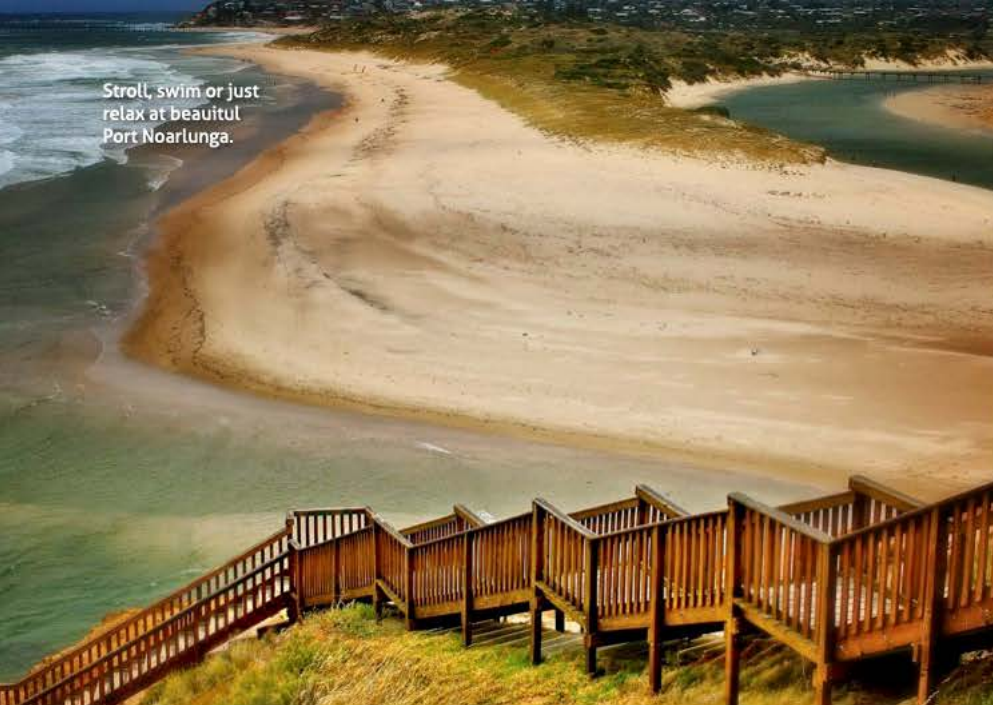
Stroll, swim or just relax at beautiful Port Noarlunga.