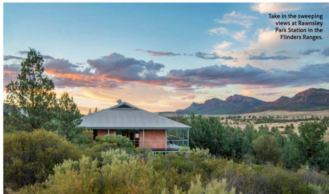
Take in the sweeping views at Rawnsley Park Station in the Flinders Ranges.

bars and a world-class wine tunnel, it will be a truly luxurious experience. For something that's a little more secluded, base yourself at one of Barossa Shiraz Estate's ( barossashirazestate.com.au ) six cottages – they're just minutes from the town of Lyndoch, yet totally surrounded by vines.