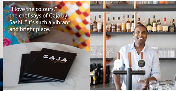
"I love the colours," the chef says of Gaja by Sashi. "It's such a vibrant and bright place."