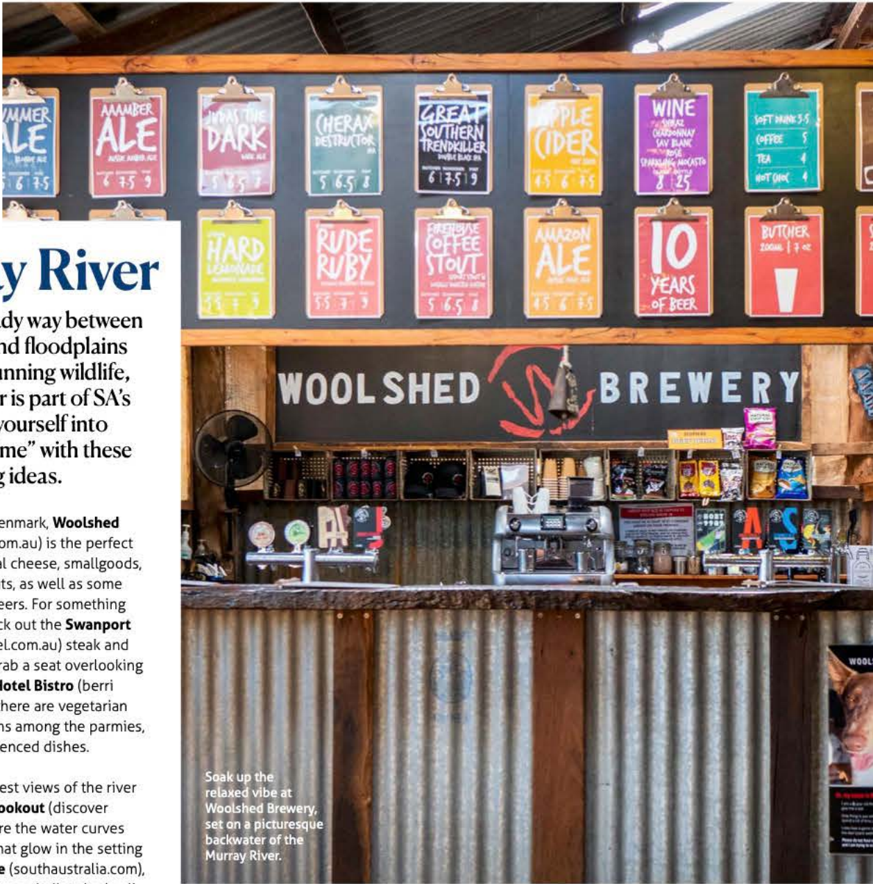
Soak up the relaxed vibe at Woolshed Brewery, set on a picturesque backwater of the Murray River.

STAY Check in to the budget-friendly rooms upstairs at the historic Swan Reach Hotel (swanreachhotel.com), which is built around an 1860s homestead, or set up camp at Berri Riverside Holiday Park (berriholidaypark.com.au), where the facilities on offer include two pools, a giant jumping pillow, playground and mini-golf course to practise your putting technique.