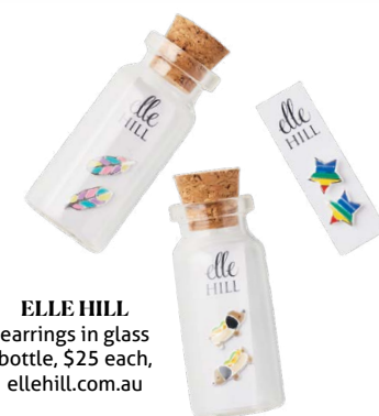
ELLE HILL earrings in glass bottle, $25 each, ellehill.com.au