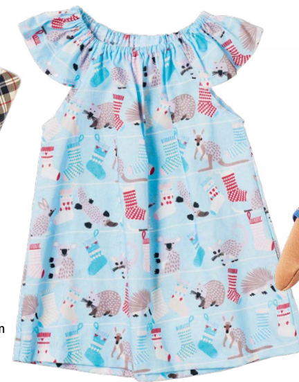
MOTHER DUCK AND MEE dress, $25, mother-duck-and-mee.square.site