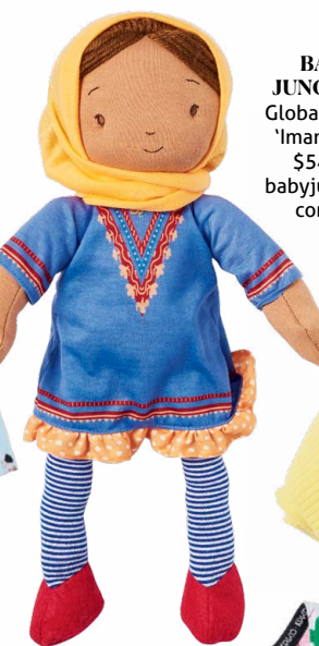
BABY JUNCTION Global Sisters 'Imani' doll, $54.95, babyjunction. com.au