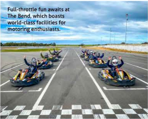
Full-throttle fun awaits at The Bend, which boasts world-class facilities for motoring enthusiasts.