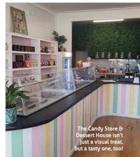
The Candy Store & Dessert House isn't just a visual treat, but a tasty one, too!

STAY Robe gets pretty busy in summer, so you'll need to book up accommodation ahead of time to secure your place of slumber. The various holiday properties on Happyshack's ( happysack.com.au ) books are ideal for making holiday memories.